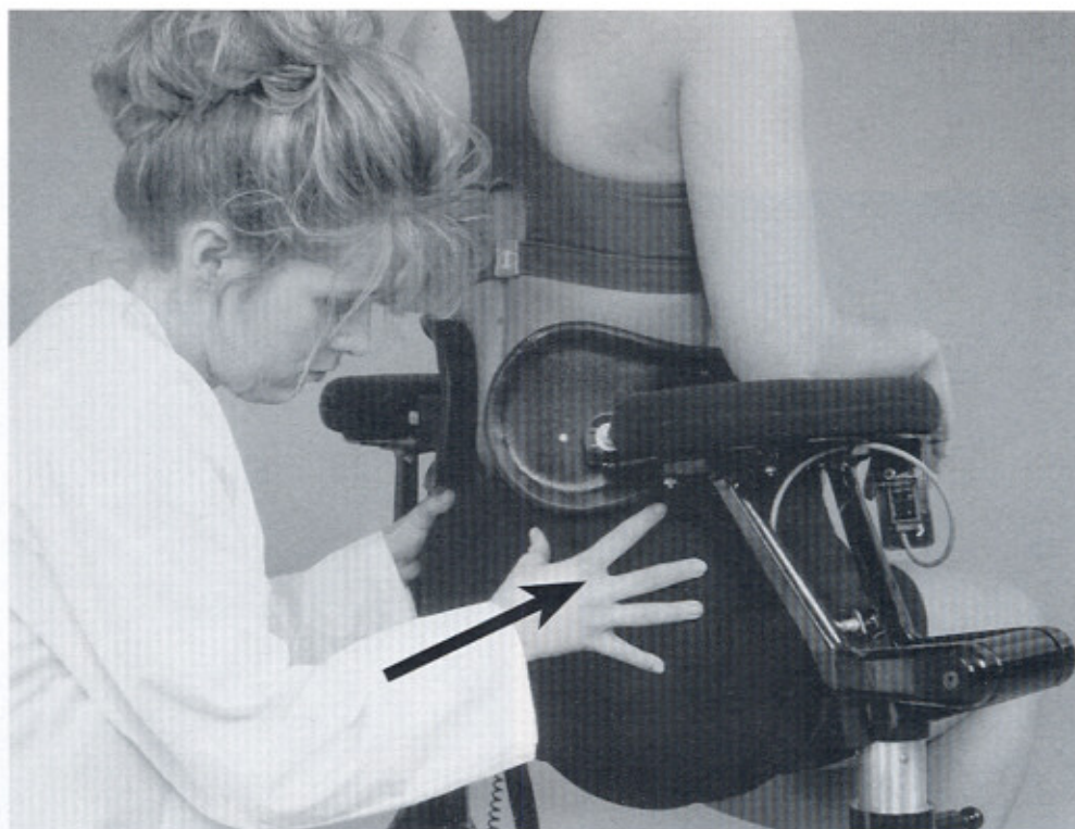
Fig. 7-12 Close-up of clinician performing posterior adjustment on LTX 3000.